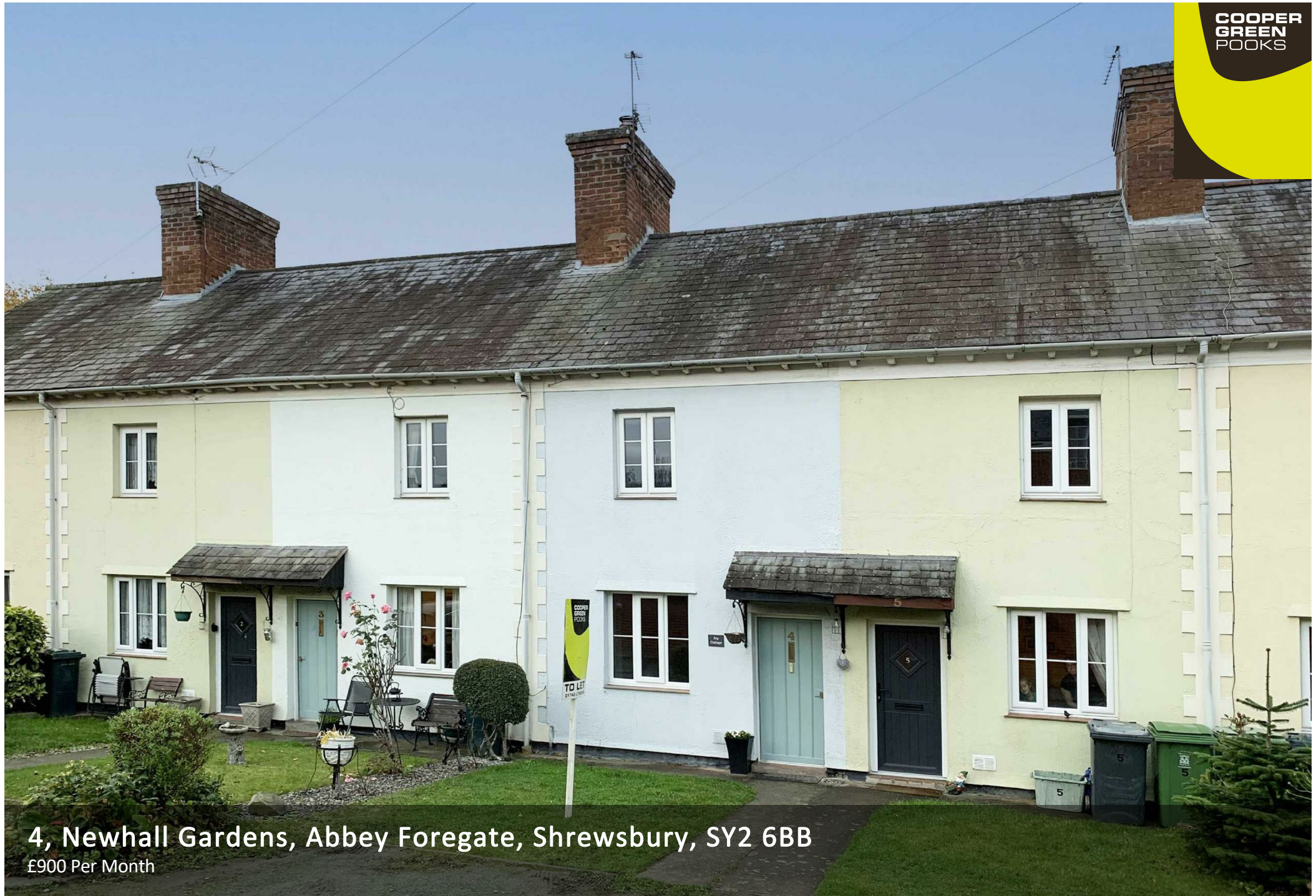
4, Newhall Gardens, Abbey Foregate, Shrewsbury, SY2 6BB £900 Per Month